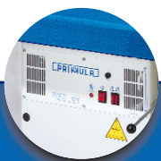
Ergonomical & functional controls