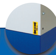
Height adjustment in 4 positions