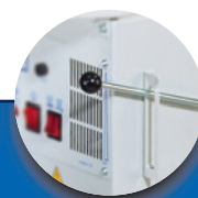
Lever for the air regulation during the blowing