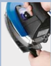
Easy installation of the Teflon shoe.