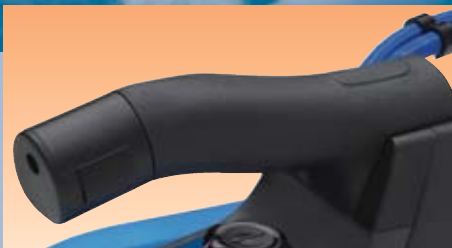
Ergonomic - anatomic Riton handle . Ergonomic - anatomic switch for steam production.