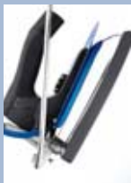
Vertical up to 90°