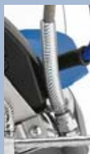
Easy connection of the steam hose with raktor.