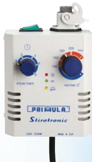
Electronic control unit which has a steam production timer and a precise temperature control ( \pm 2^{\circ}\text{C} ).