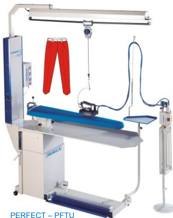
PERFECT – PFTU

Power supply:...400V-3ph/N/PE-50Hz or 230V-1ph-50Hz