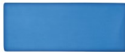
Ironing Surface FL 115x55cm