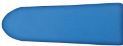
Ironing Surface DOB 110x38cm